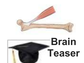
Each row and column add up to 15. Use the numbers from 1-9, only using each number once.

Tendons can require more support to heal than muscle tissue as they have less blood supply.