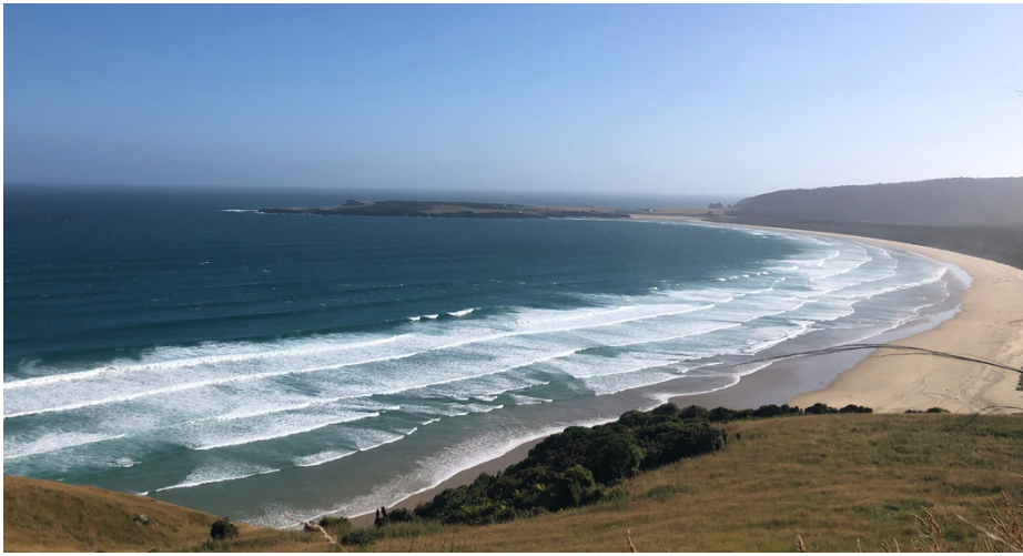
THE CATLINS - NEW ZEALAND