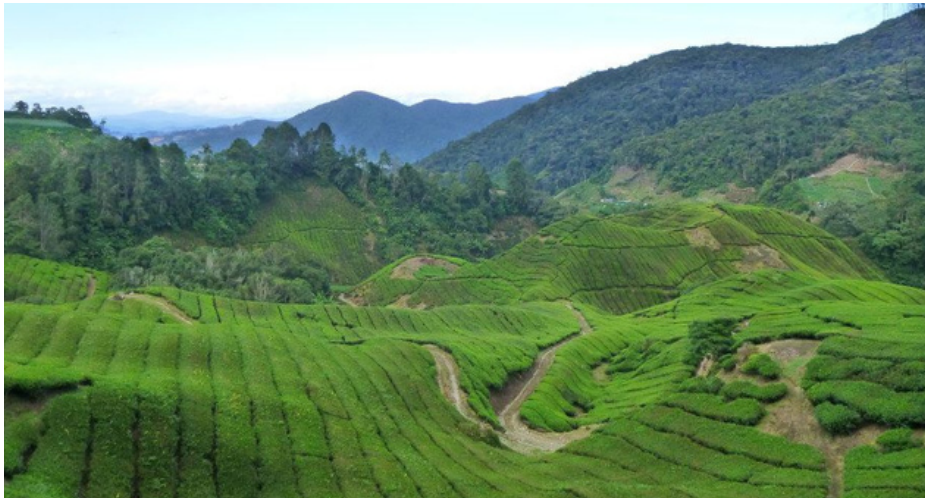
CAMERON HIGHLANDS - MALAYSIA