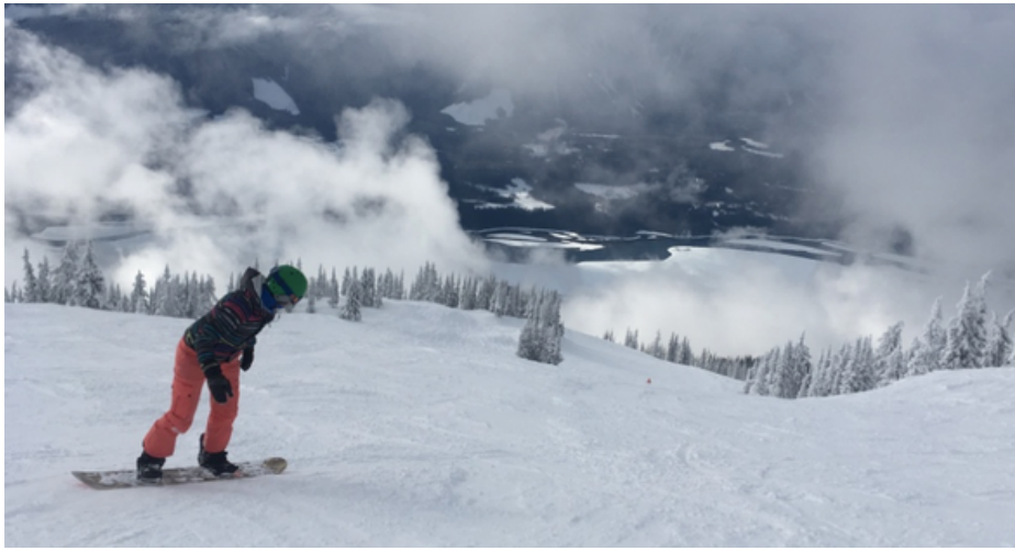
REVELSTOKE - CANADA